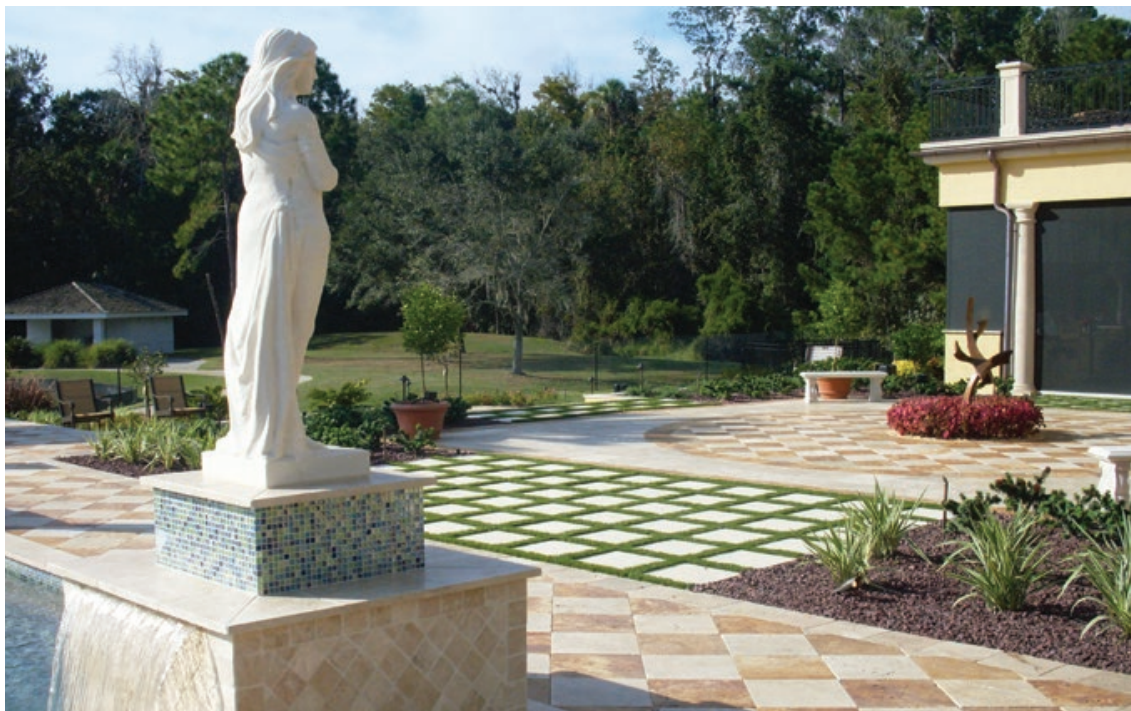
Right: Hand carved Italian limestone statues atop pedestals at each corner of shallow pockets in the pool replicate the statues of the Four Seasons. Cast stone steppingstones laced with artificial grass act as a bridge, connecting the terraces.

In the rear part of the home, the Landscape Architects transformed the space by creating an open outdoor area with a pool, pergola and fire feature, and continued the rich design with more Italian limestone statues. Turkish travertine pavers are continued in the back of the home and around the pool area in checkered ivory and gold. The Landscape Architects separated the design into a series of spaces with artificial grass joints between cast stone steppingstones connecting each area. The pergola is made of large cedar planks atop cast stone columns that