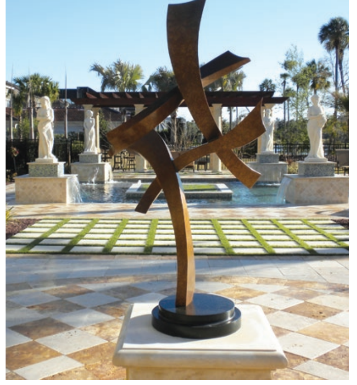
Left: All garden elements and features were designed intentionally and up front, leaving no part of the process done independently. Supplied by a sister company to the Landscape Architect firm, this bronze statue was fabricated by a metal sculptor in Colorado and centered in the backyard terrace of the home, adds contrast with its contemporary style.